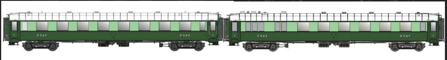
Models fitted with internal lighting